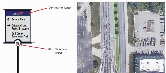
Left: wayfinding signage; Right: median landscaping

LANDSCAPING AND URBAN DESIGN: Traffic along Route 83 is not anticipated to reduce, but the experience of using the roadway could be improved with low-maintenance plantings and more directional signage to highlight the communities and amenities. Recommendations include added landscaping and urban design elements, such as median plantings (as now found in the northern part of the corridor), native plantings and bioswales (added to ROWs and along roadways), and new wayfinding and gateway signage (both for communities and the corridor itself).