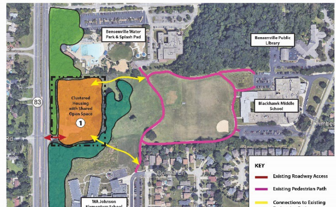
Top: Commercial Redevelopment along Lake Street Bottom Left: Redevelopment as townhomes